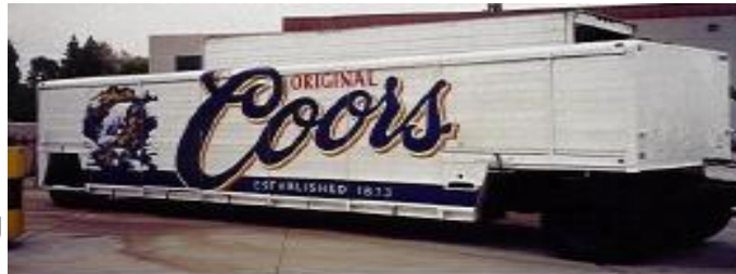
Coated Exterior Roof and Interior Doors

**In air conditioned/refrigeration/freezer trailers, the reduction of the heat through the roof will reduce the energy/fuel requirements, thus lowering operating costs and lowering refrigeration/freezer unit maintenance costs. (Tests show a 10% to 25% reduction in reefer fuel consumption and reefer run times).