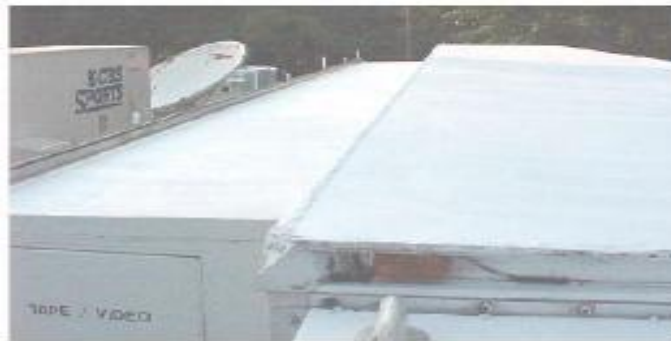
Coated Exterior Roof

**By cutting the heat that penetrates the roof, the contraction and expansion of the roof will be reduced, thus reducing roof leakage and the costs of roof maintenance and damage to goods.